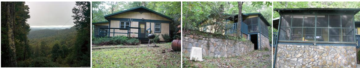
This is a view from Pilot Ridge R...

DOM: 12 CDOM: 241 Sr Contr: UC Dt: DDP-End Date: LTC: Closed Dt: Close Price: